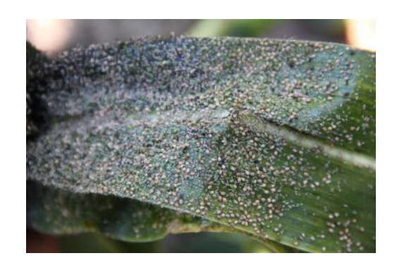
A corn plant heavily infested by aphids. Sooty molds have already accumulated on the leaf surfaces due to the heavy deposits of honeydew.