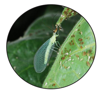
Green lacewing feeding on aphids.