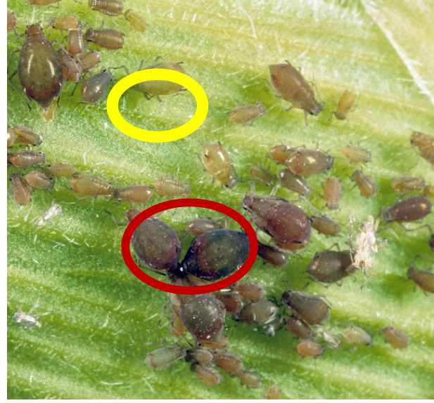
Encircled in red are the adults and in yellow are the nymphal stage.