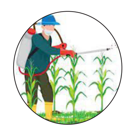
NOTE: In the early stages (pre-tassel) of corn development, aphid control is not usually necessary.